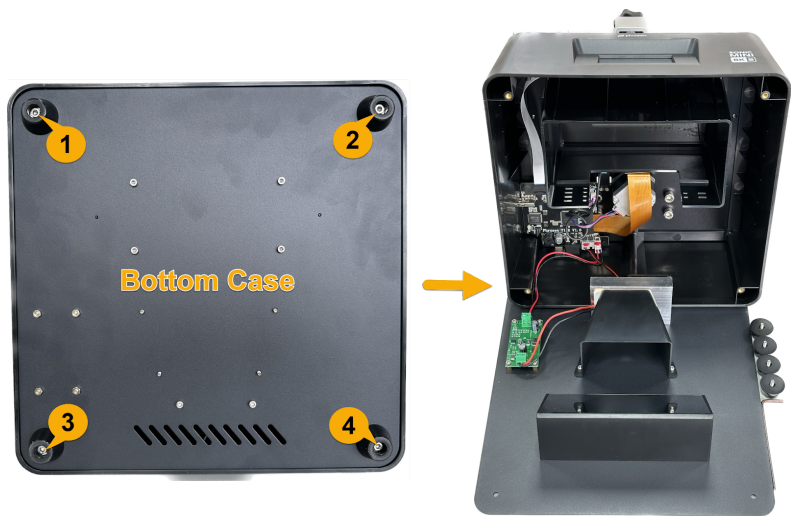
Step 4: Disconnect all cables/ wires (see the below picture) that are linked to the mainboard.